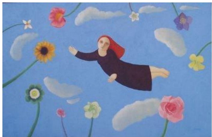
"Summer Sky" Nicola Slattery

The cost of weekly therapy for six months, if you don't use insurance: about $1,800-2,600; every other week: $900-$1,300. The value of healthy, honest and fulfilling relationships, saved relationships, enjoyment of one's career, having a healthy body, fresh enthusiasm for learning to trust and to love, living a more meaningful life, and living with joy? Priceless